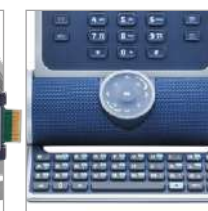
Alphabetic keyboard option