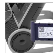
WLAN/Bluetooth module included