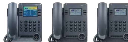
ALE-30h Page 12