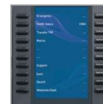
Key expansion module option