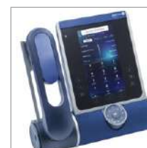
100% Touch experience