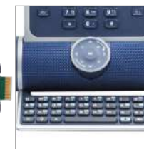
Alphabetic keyboard option