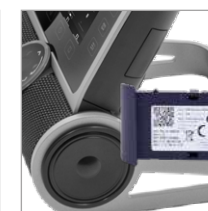
WLAN/Bluetooth module option