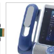
Bluetooth handset option