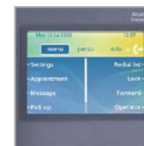
Large colour display