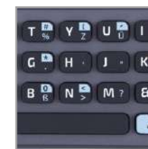
Alphabetic keyboard option