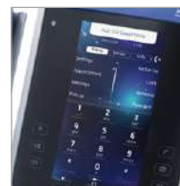
100% Touch experience