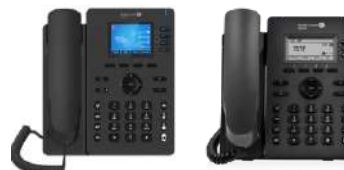
ALE-3 Page 17