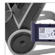
WLAN/Bluetooth module option