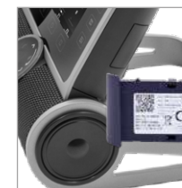
WLAN/Bluetooth module included