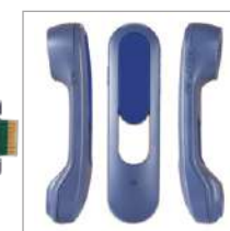
Cordless handset option