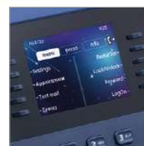
Large colour display