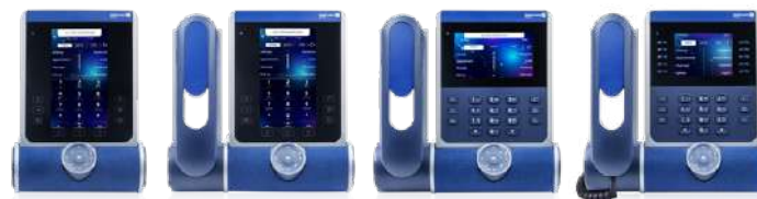
ALE-500 without handset Page 5